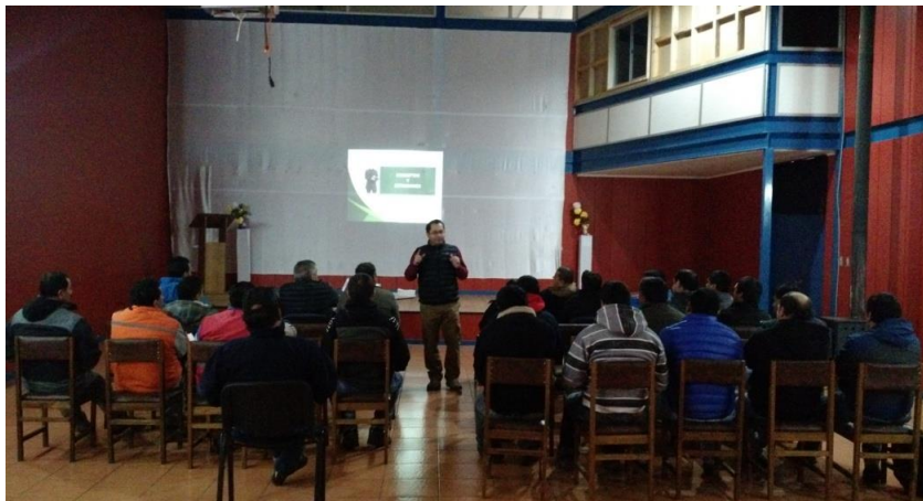
Figure 7. Labour risk prevention and worker safety training for workers in management positions (conducted on 23 July 2015)