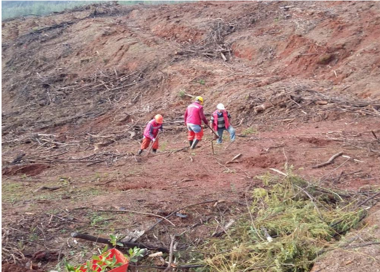
Figure 1. Day 2 of the river basin restoration by Bosques Cautin