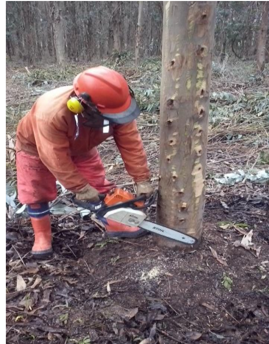
Figure 6. Training on security and risk prevention when using logging machinery (conducted on 10 August 2015)