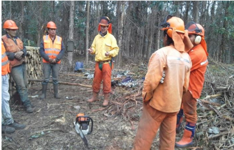
Figure 5. Training on security and risk prevention when using logging machinery (conducted on 10 August 2015)