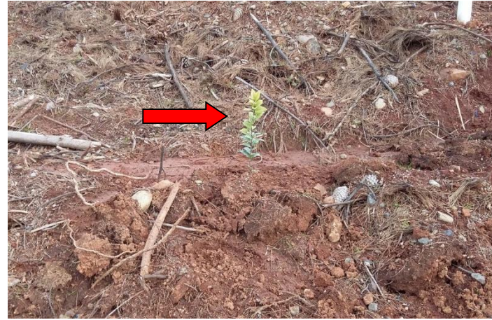
Figure 2. One of the 500 plants of native species planted in river basin 1