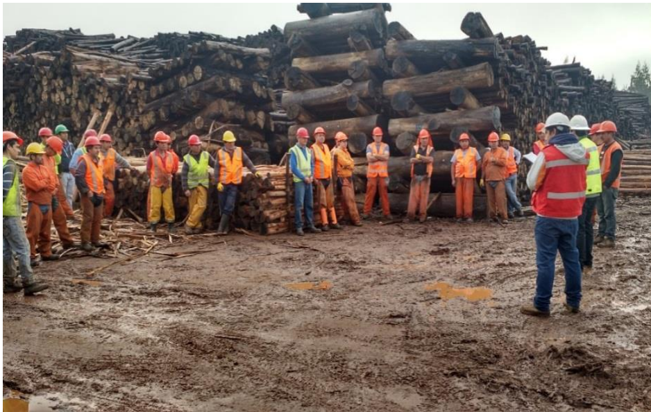
Figure 4. Training on safe working practices, safety regulations, FSC requirements, and personal safety (conducted on 19 June 2015) – 25 workers from the subcontractor Emsefor Fabián Ancamilla attended

Bosques Cautin has also implemented a Programme for the Support for Contractors of Mapuche Origin to Improve their Access to Technologies. This support has been provided through the technical services of an assessor. Bosques Cautin currently has seven stable subcontractors, of which four are of Mapuche origin. Since May 2015, the subcontractors have had access to the support programme through which they are receiving training and acquiring new skills on different topics such as safety and environmental issues. One of the subcontractors (Rama Verde) is also receiving specific support from the assessor to acquire specific professional skills in the use of technically advanced machinery for timber harvesting (skidder). Bosques Cautin's aim is to provide the services of this assessor to all other company's subcontractors in the future, in order to increase the technical skills and capacity of its subcontractors.